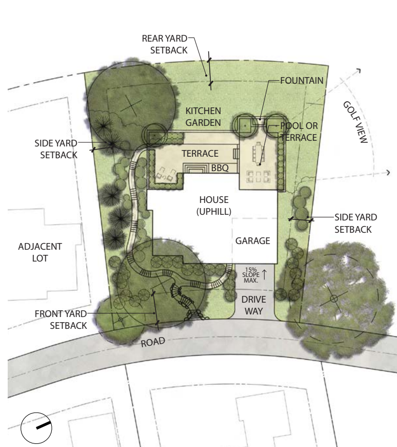
0 50 100' 1" = 50'