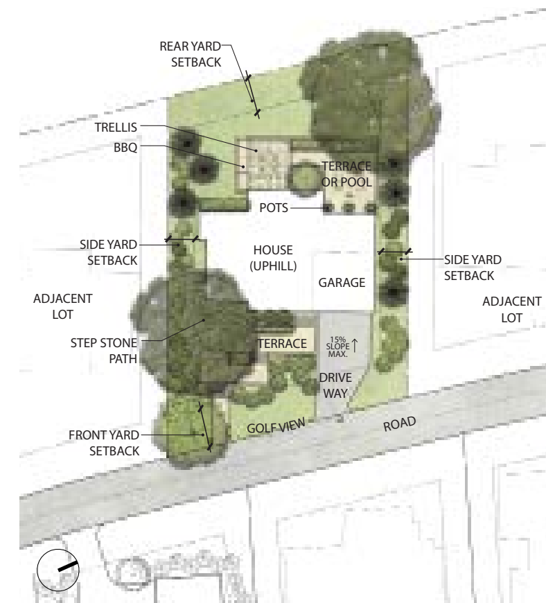
0 50 100' 1" = 50'